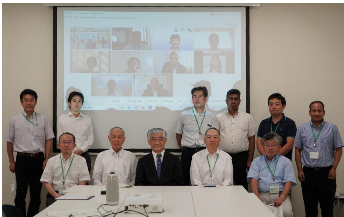
Participants in the online kick-off meeting